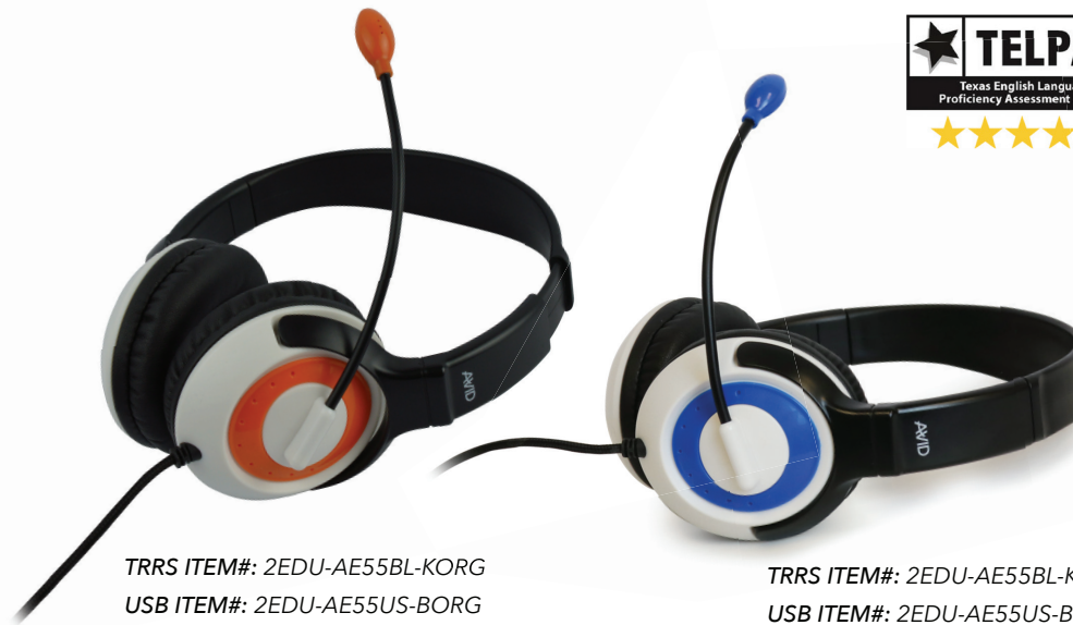
TRRS ITEM#: 2EDU-AE55BL-KORG USB ITEM#: 2EDU-AE55US-BORG